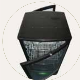
Double lockable curved doors